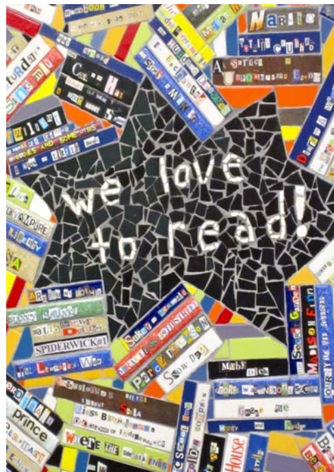
2010 MLK School Mosaic "We Love to Read"