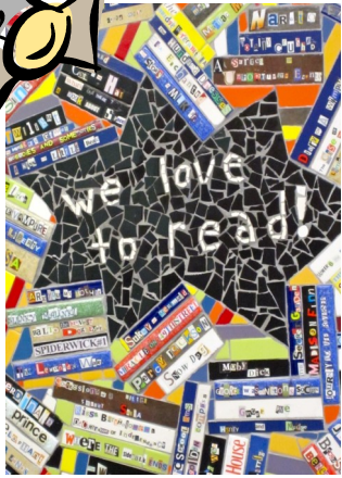
2010 MLK School Mosaic "We Love to Read"